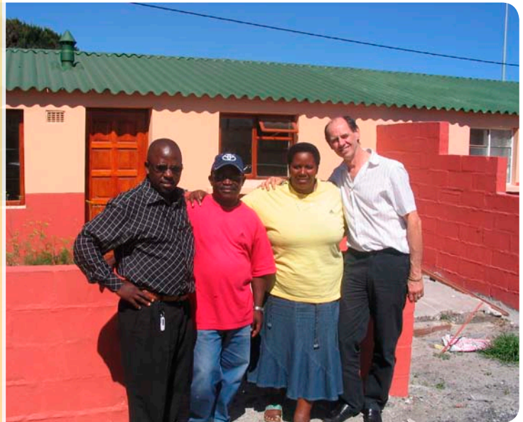
Ilinge Labahlali Housing Co-operative, Cape Town