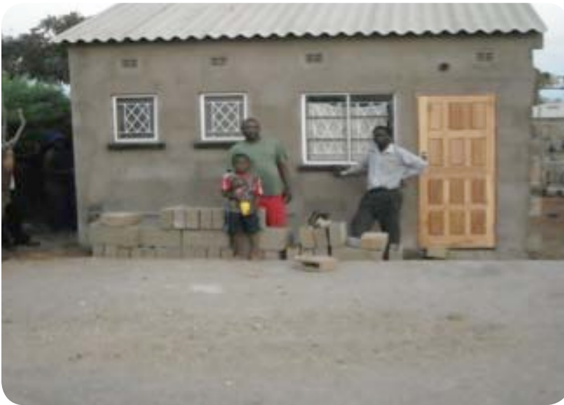
Batonga Housing Cooperative - Kariba

Co-operatives. ZINAHCO does the comprehensive co-op training, responding to the member needs.