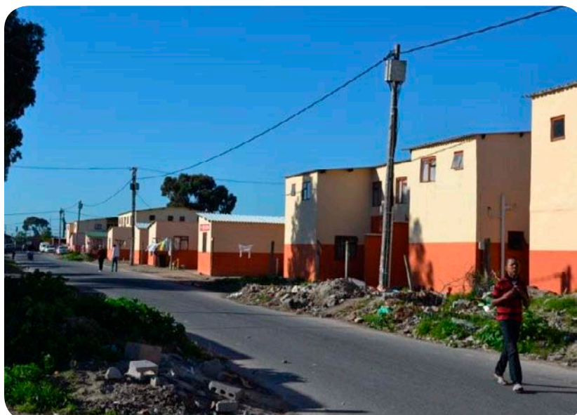
Ilinge Labahlali Housing Co-operative, Cape Town

The 2009 Housing Code states that the human settlement process should be participatory and decentralised to allow for an effective response to priorities and opportunities at the local level. It recognises that there should be support for community participation in the housing process, thereby facilitating skills transfer and economic empowerment. The human settlement creation process must be economically, fiscally, socially, financially and politically sustainable in the long term. At present this is mainly achieved via the Enhanced