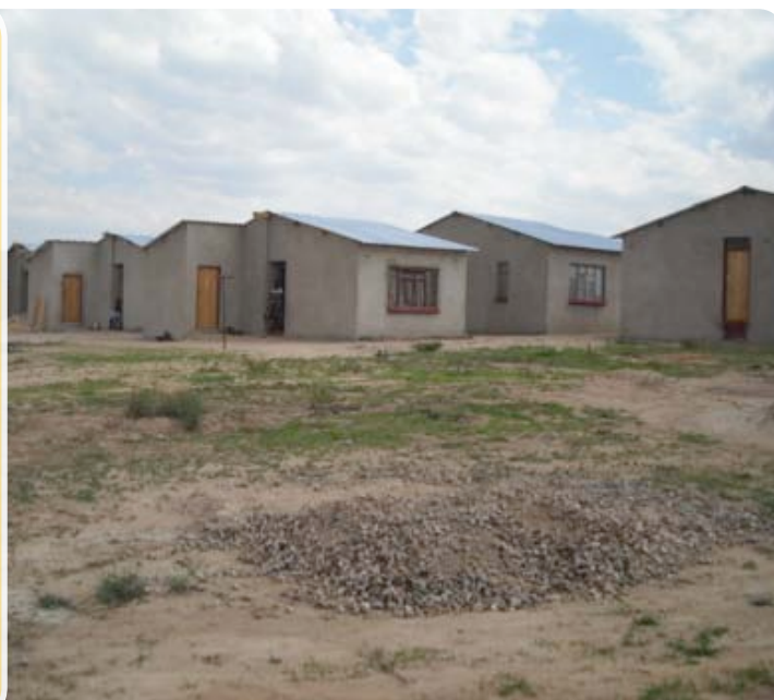
Chako Ndechako Housing Cooperative - Chitungwiza

People: The majority of the 10,000 member households are living on their stands (plots of land), either in temporary structures or core houses, or renting these facilities out.