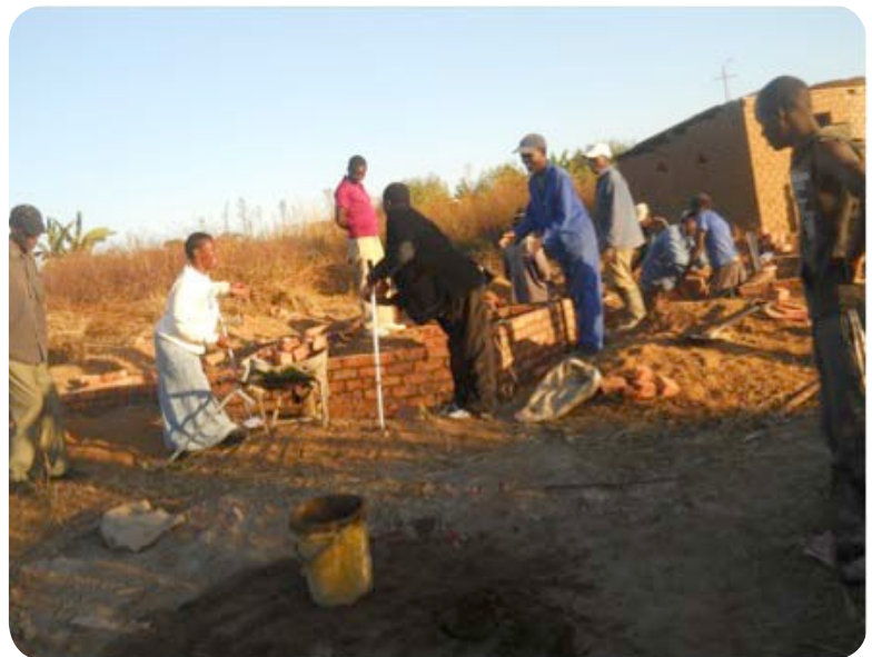
Mushawedu Housing Cooperative, (cooperative composed of people living with disabilities) - Chitungwiza

combination of self-help and small builders, and in some cases, larger builders may take on some or the entire project;