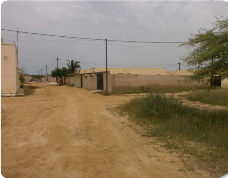
Coopérative d'habitat des Agents de la SAED et Affiliés - CHASA

L'État a aussi adopté une politique de restructuration et de régularisation foncière afin de venir à bout des quartiers informels. Le progrès est toutefois modeste car il existe peu de sites de logement, les processus de mise en œuvre sont lents et le financement des initiatives difficiles.