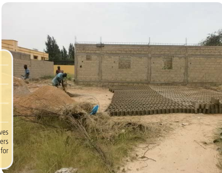
Coopérative des Encadreur du Prytanée Militaire de Saint-Louis - COOPEP

Total co-op housing stock: 744 certified co-operatives for a total of 74,400 units (2009) and 100,000 members (2012). Building and housing co-operatives account for approximately 25% of all social housing in Senegal.