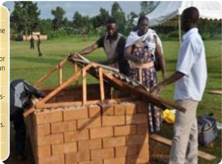
Some of the members setting up a demo unit with the products they make.