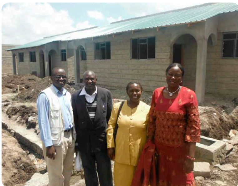
NACHU and Ngalawu Housing Co-operative, Kenya 2013

Kenya Housing Authority and the National Social Housing and Infrastructure Fund for the provision of housing and related purposes;