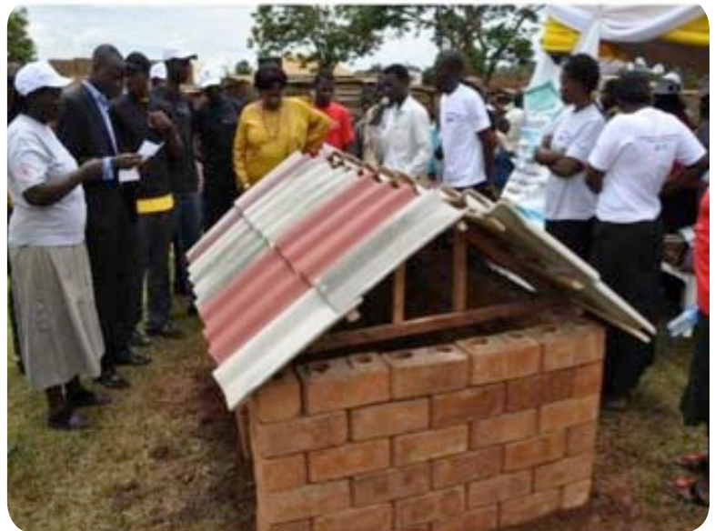
A demo unit constructed by members of the PHCs using the interlocking blocks and the roofing tiles that they make

co-operative on their behalf. With the exception of 2 housing co-operatives who have been able to hire a staff to assist in the management of the co-op's affairs, housing co-operatives, at this time, cannot afford to hire external staff due to insufficient funds. Management is done by the Board and the committees.