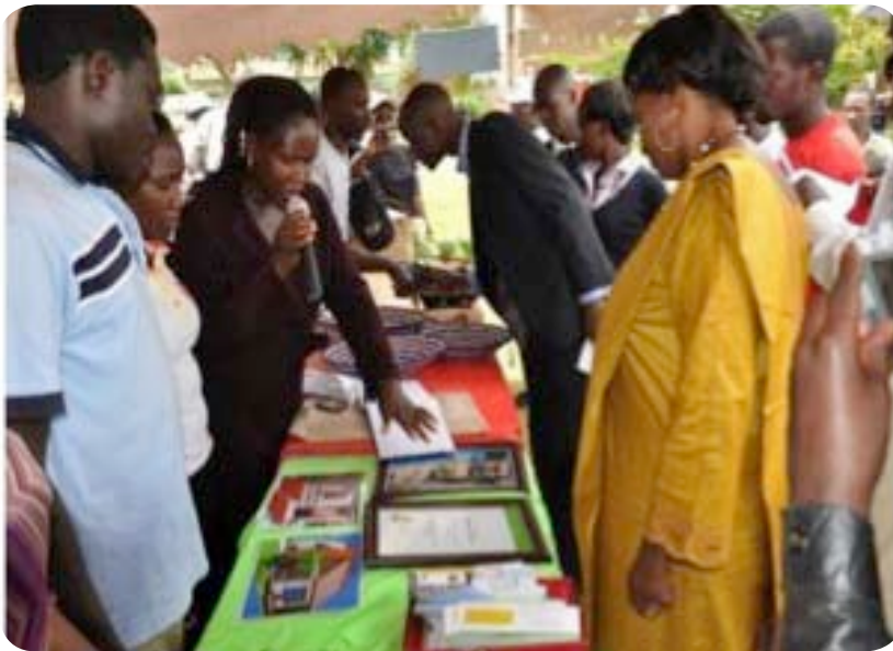
The PHCs displaying some of their proposed plans for their future houses during the World Habitat Day celebrations in October 2012