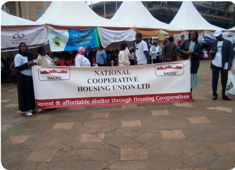
Fatabab Housing Cooperatives Members during the International Cooperatives Day Celebrations

60% of the population in Nairobi today lives in slums. The adoption in 2004 of the new National Housing Policy and KENSUP – the Kenya Slum Upgrading Program brought hope, as the government made a commitment to improve living conditions by 2020.