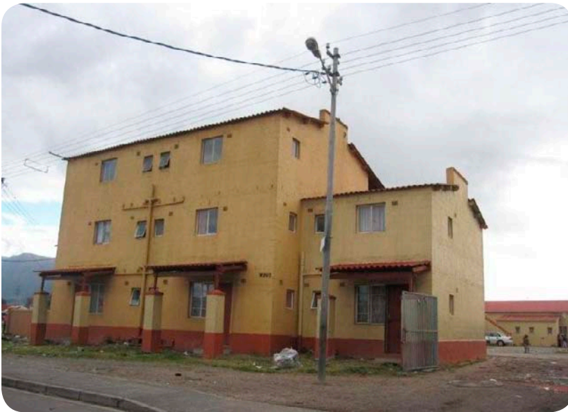
Welcome Zenzile Housing Co-operative, Cape Town

funding mechanism, along with targeted donor support and efforts of key NGO's, served as a catalyst for the development of pilot housing co-operative projects. From 1997 seven housing co-operative schemes using the institutional subsidy mechanism were developed by Cope Housing Association. Newtown Housing Co-operative (351 units) was the first housing co-op to be registered. Afesis Corplan and the East London Housing Management Co-operative facilitated the establishment of the Amalinda project comprising 9 housing co-operatives and 216 units with the aim of transferring the units to individual ownership. (Newtown Housing Co-operative faced difficulties and, after a legal case, the building was bought by Johannesburg Housing Company. While many members still live in the building the co-operative no longer has legal control of the property. Members in the Amalinda project have mainly not been able to take individual transfer of their units).