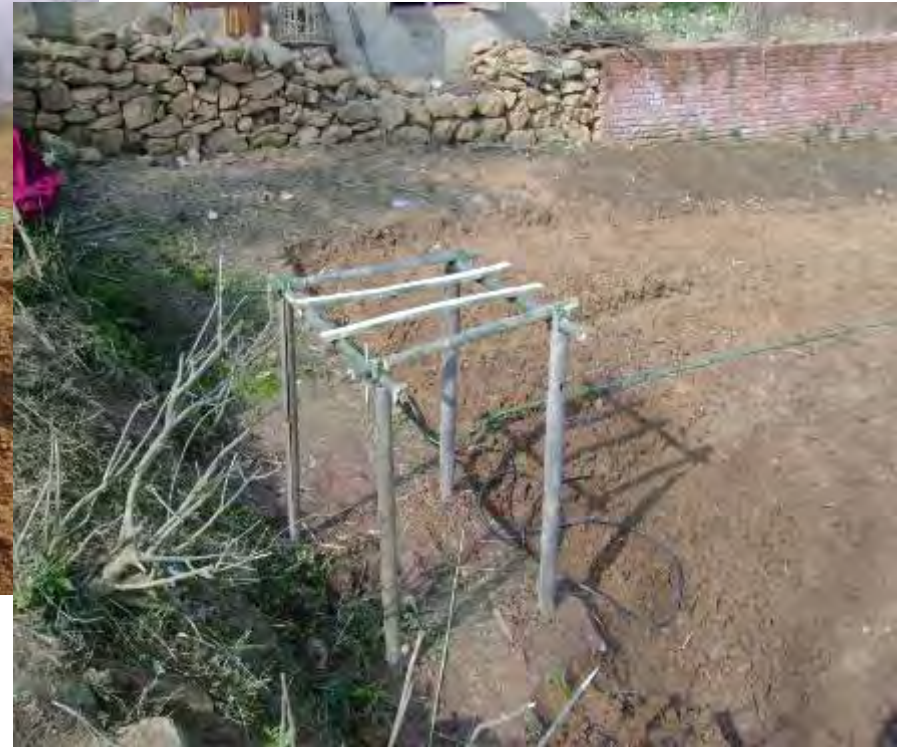
Make the platform