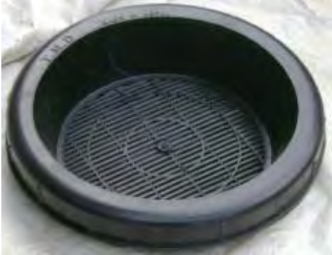
Filters – coarse & fine