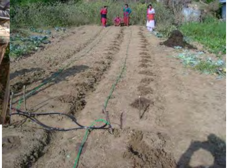
Mark the wet spots for planting