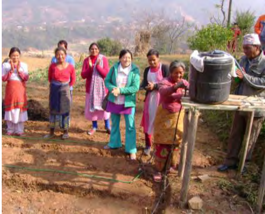
Fill tank and open valve