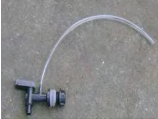
Outlet Set – tap & gate valve