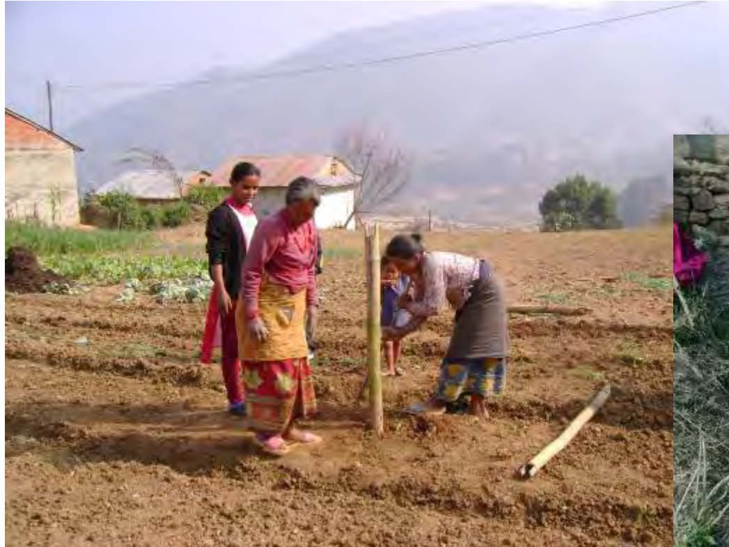
Drill four holes to erect poles