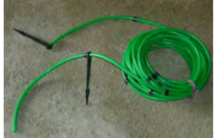
Drip pipe (8 mm diameter PVC soft pipe)