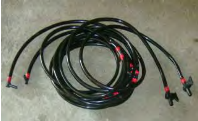
Mainline Pipe (14 mm PVC soft pipe)