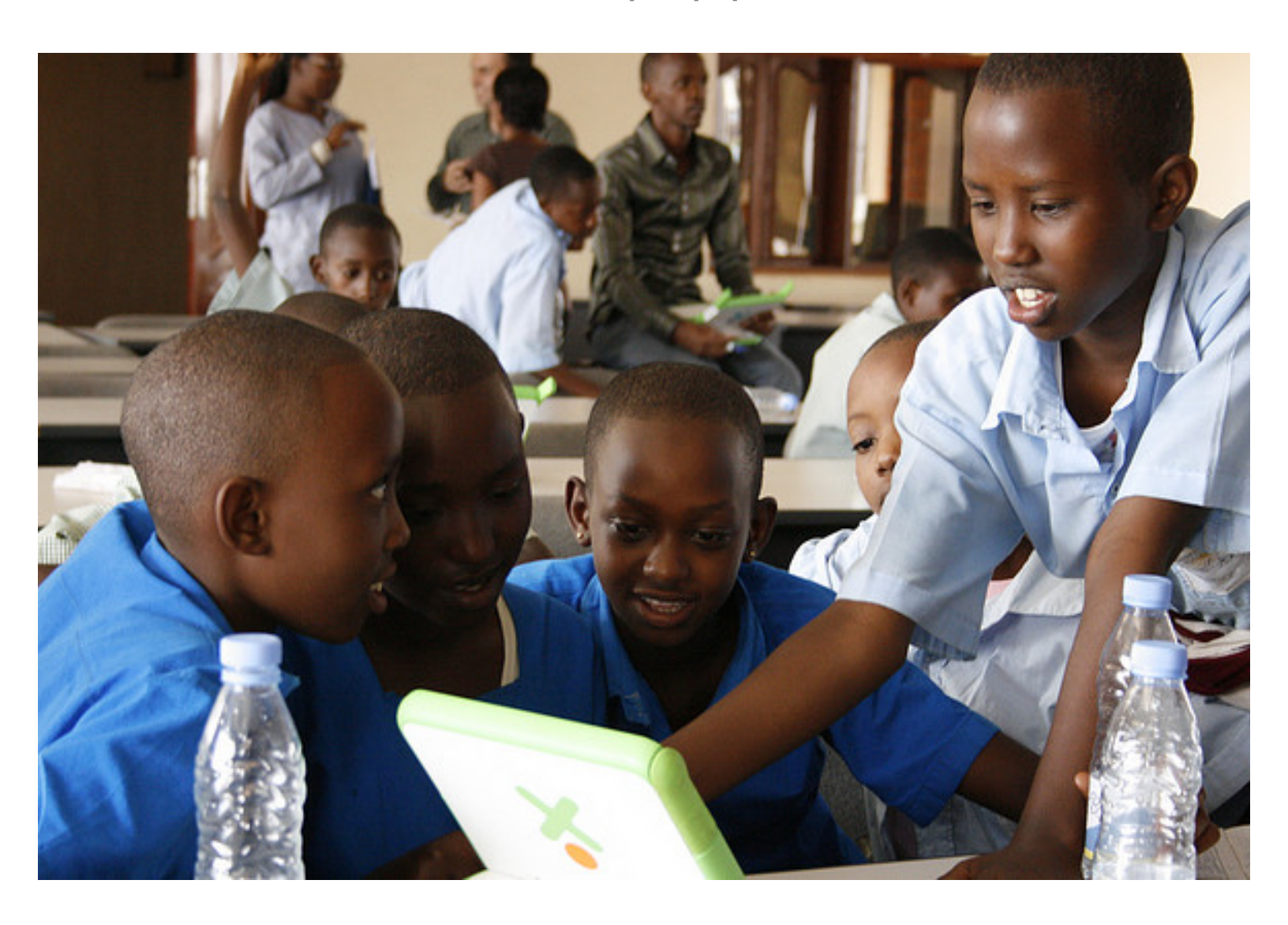
Transforming Society Through Access to a Modern Education