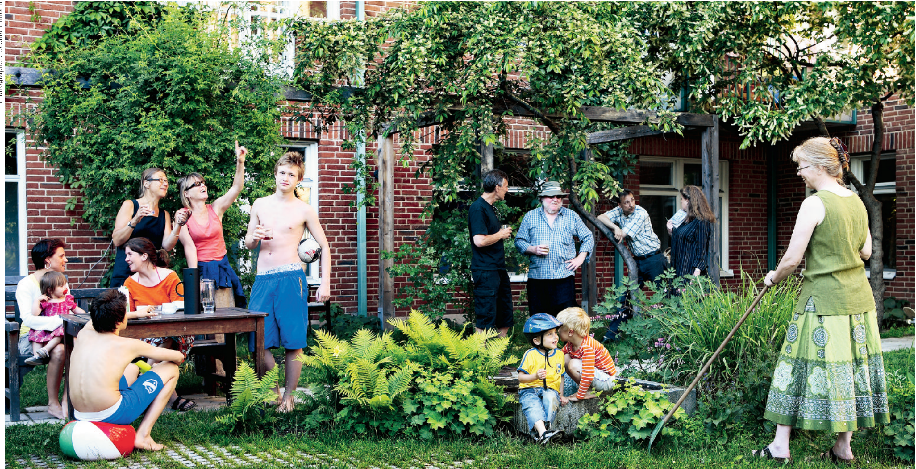
The photo is from the Collective House Trekanten in Stockholm. House-owner: Svenska Bostäder.