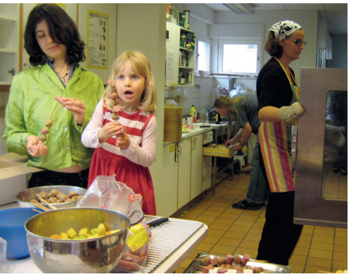
Children do the cooking at Södra Station, Stockholm