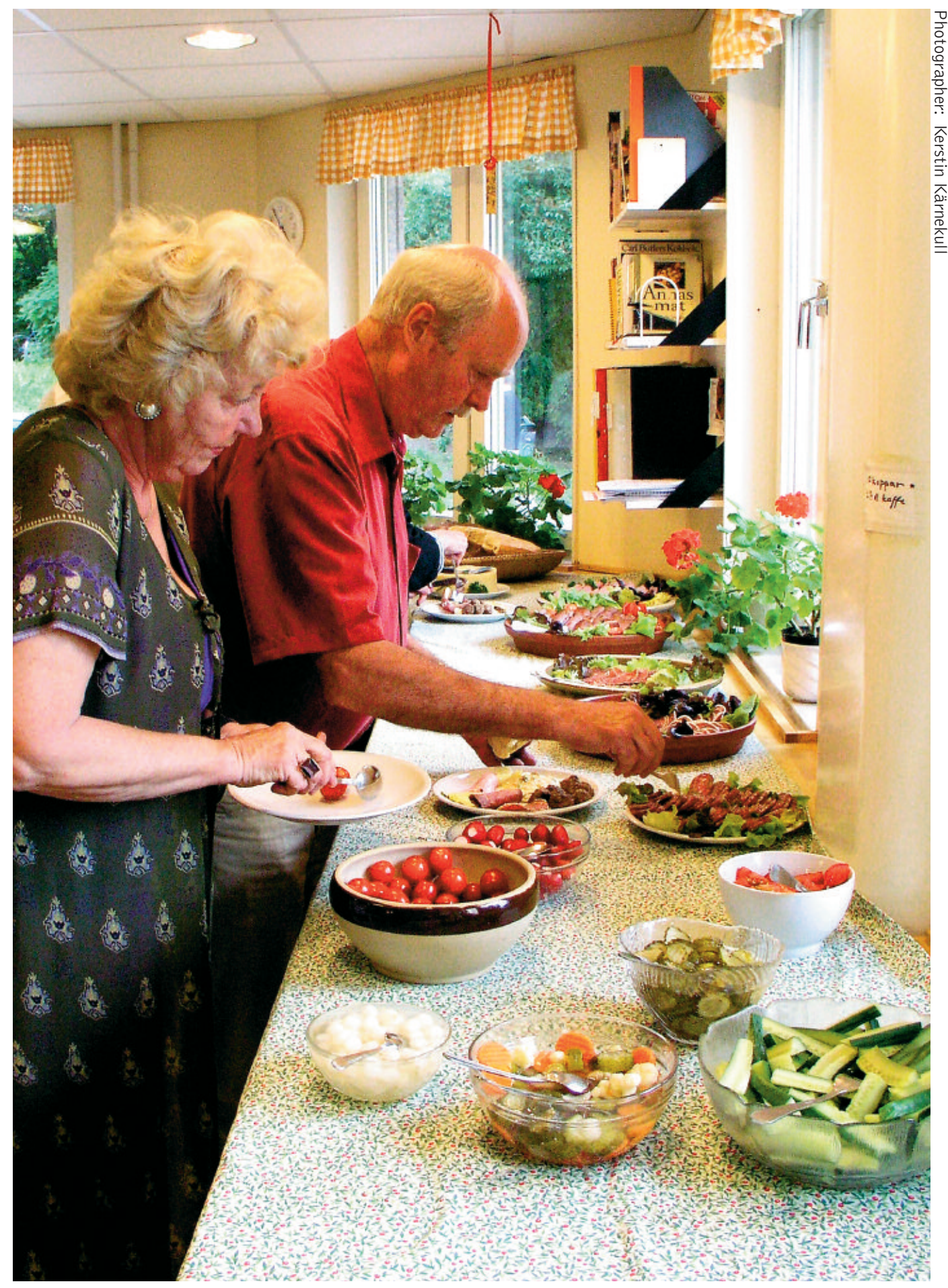
Buffét at Färdknäppen, Stockholm. House-owner: Familjebostäder.