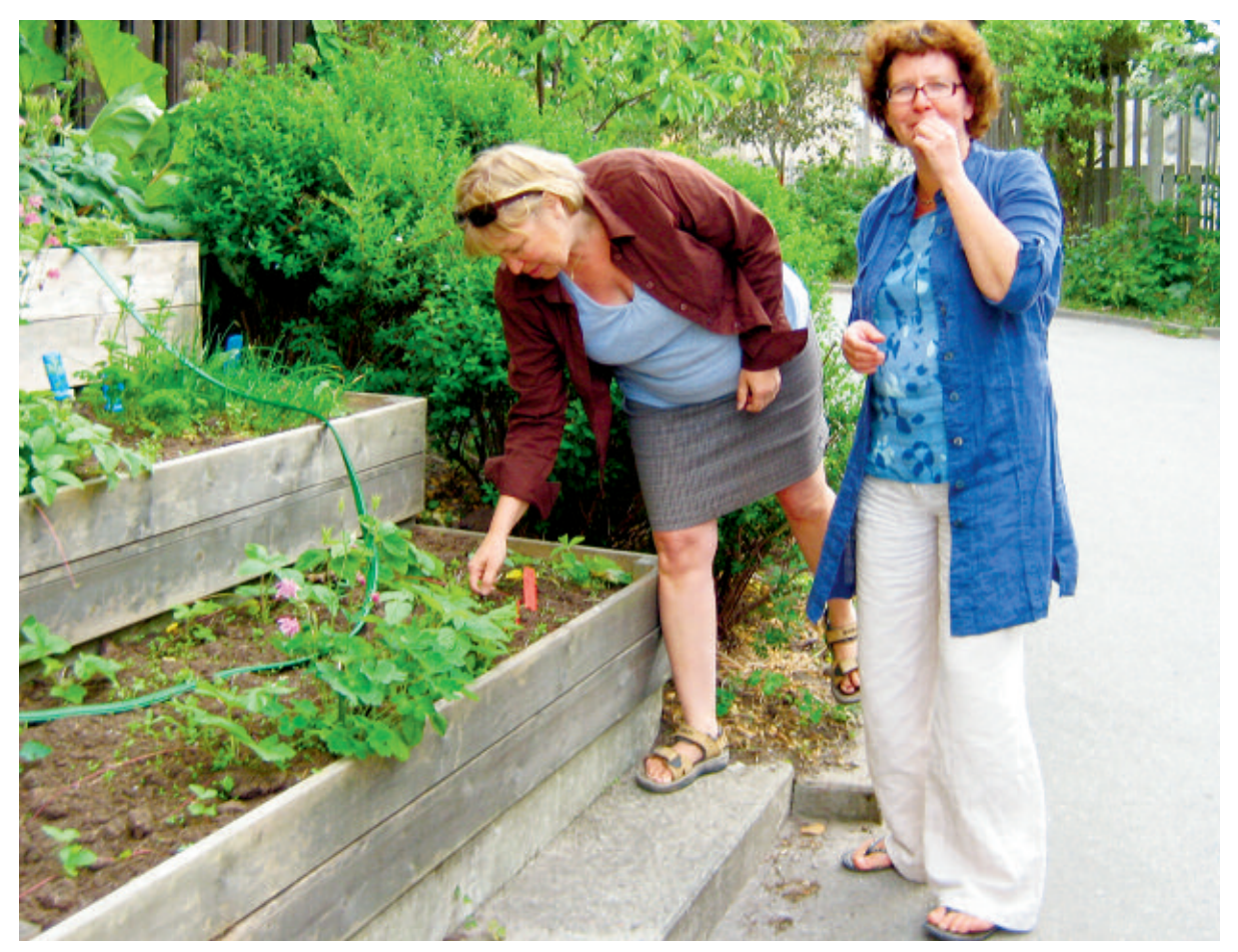
Cultivators at Fullersta Backe, Huddinge. House-owner: Huge Fastigheter AB