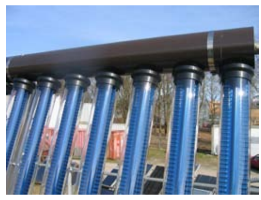
Figure 9. An evacuated glass tube with a heat pipe.

All-glass evacuated tubular collectors are designed in a different way. They are based on double glass tubes (see Fig. 10) with the evacuated space between the glass tubes. The outside of the inner glass wall is treated with an absorbing selective coating and works as the absorber. With solar irradiation on the tube, the inner glass tube gets very hot. The heat can be transferred from the inner glass tube to the solar collector fluid in different ways: Either the solar collector fluid is flowing directly inside the inner glass tube or the solar collector fluid can flow in a metal pipe, which is in good thermal contact with the inner glass tube.