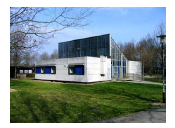
Figure 12. This is a photo of the "Null Energihuset" built at the Technical University of Denmark in 1975. It is the first house to attempt full seasonal solar heating through storage at a high latitude. Details are elaborated in the text.

insulation in the walls and floor. This amount of insulation was approximately three times as large as that used on most houses at the time. It incorporated insulating shutters on the windows, one of the first air-to-air heat exchangers ever used on a domestic residence, and a solar heating system that was designed for 100% solar space and water heating. Despite some problems with air sealing of the envelope, and breakage of glass on the solar collectors, the house was able to