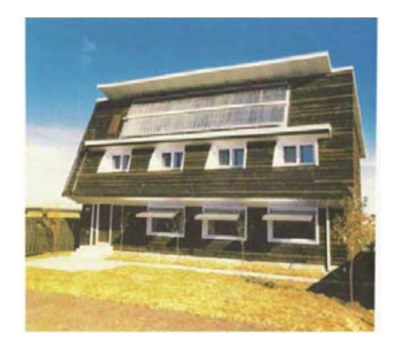
Figure 13. South side of the Saskatchewan Conservation House, 1977. Note the active solar panels (vacuum tube) on the upper part of the south wall, and the insulating shutters on the lower windows. An 11,000 liter water storage tank was incorporated to store solar heat within the house.

Were the real costs of energy to be paid, it is much more likely that autonomous houses would be feasible.