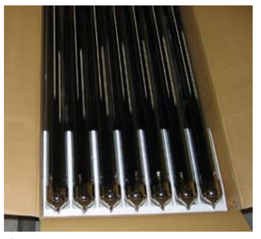
Figure 10. A double glass tube.

• The collectors have a low heat loss coefficient. The evacuated space in both